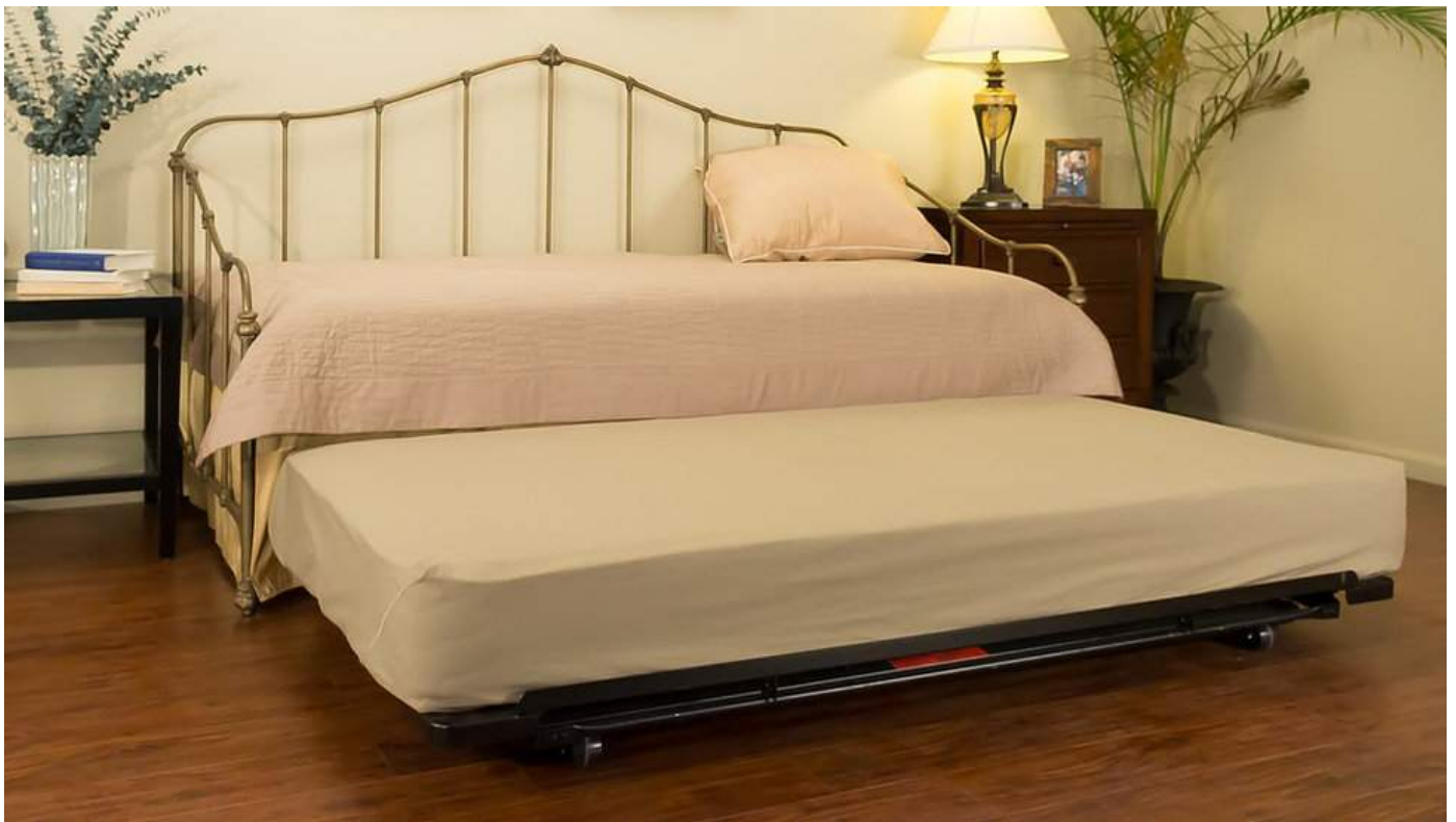
Shown in Bronze Patina