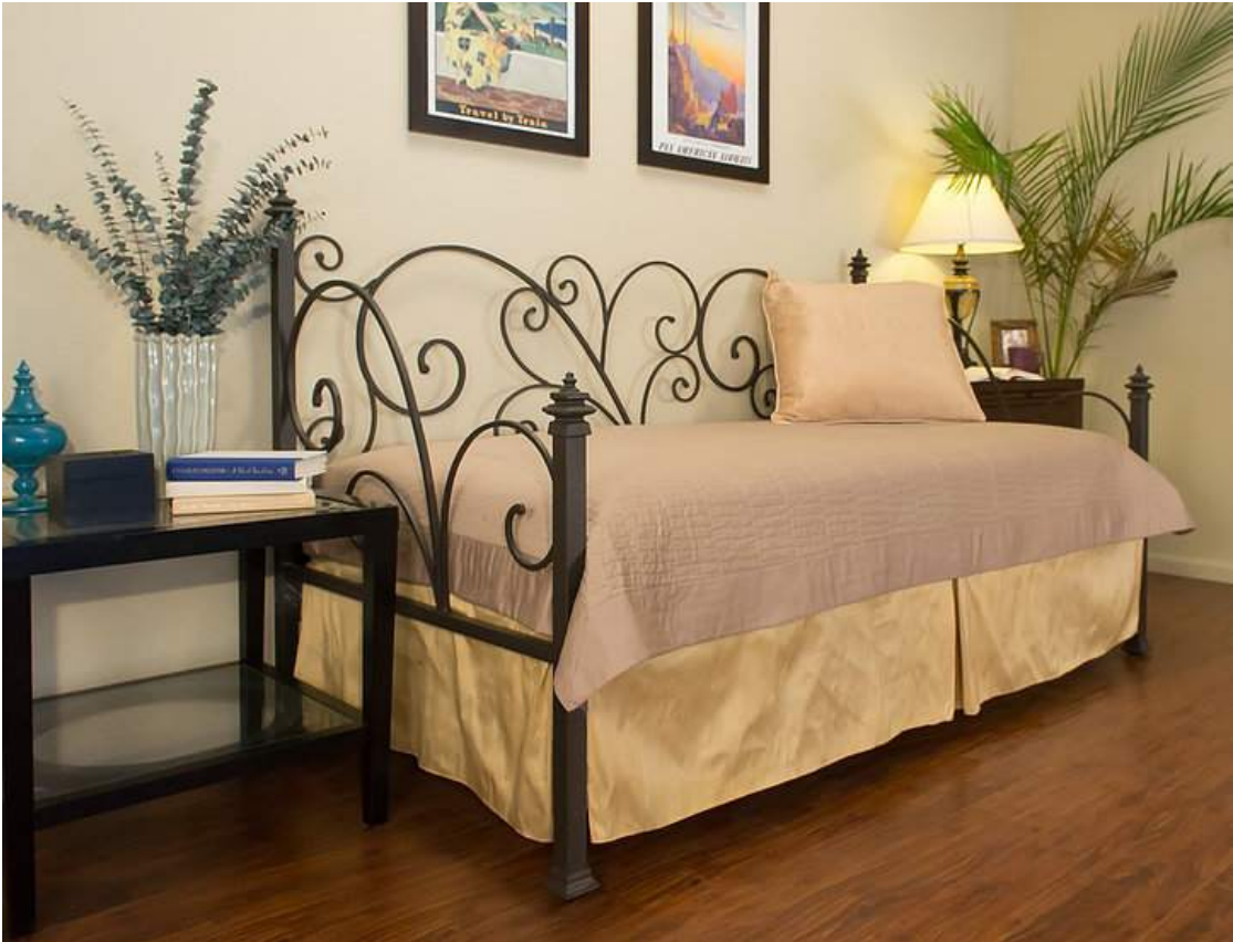
Shown in Gun Metal